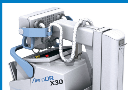
Compact, space saving design