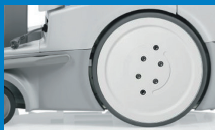
Two independent motors and large wheels for comfort

AeroDR X30 can be combined with all Konica Minolta's robust, carbon fiber Flat Panel Detectors available in three sizes: 10 x 12" , 14 x 17" or 17 x 17".