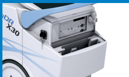
Detectors can be charged in the bin